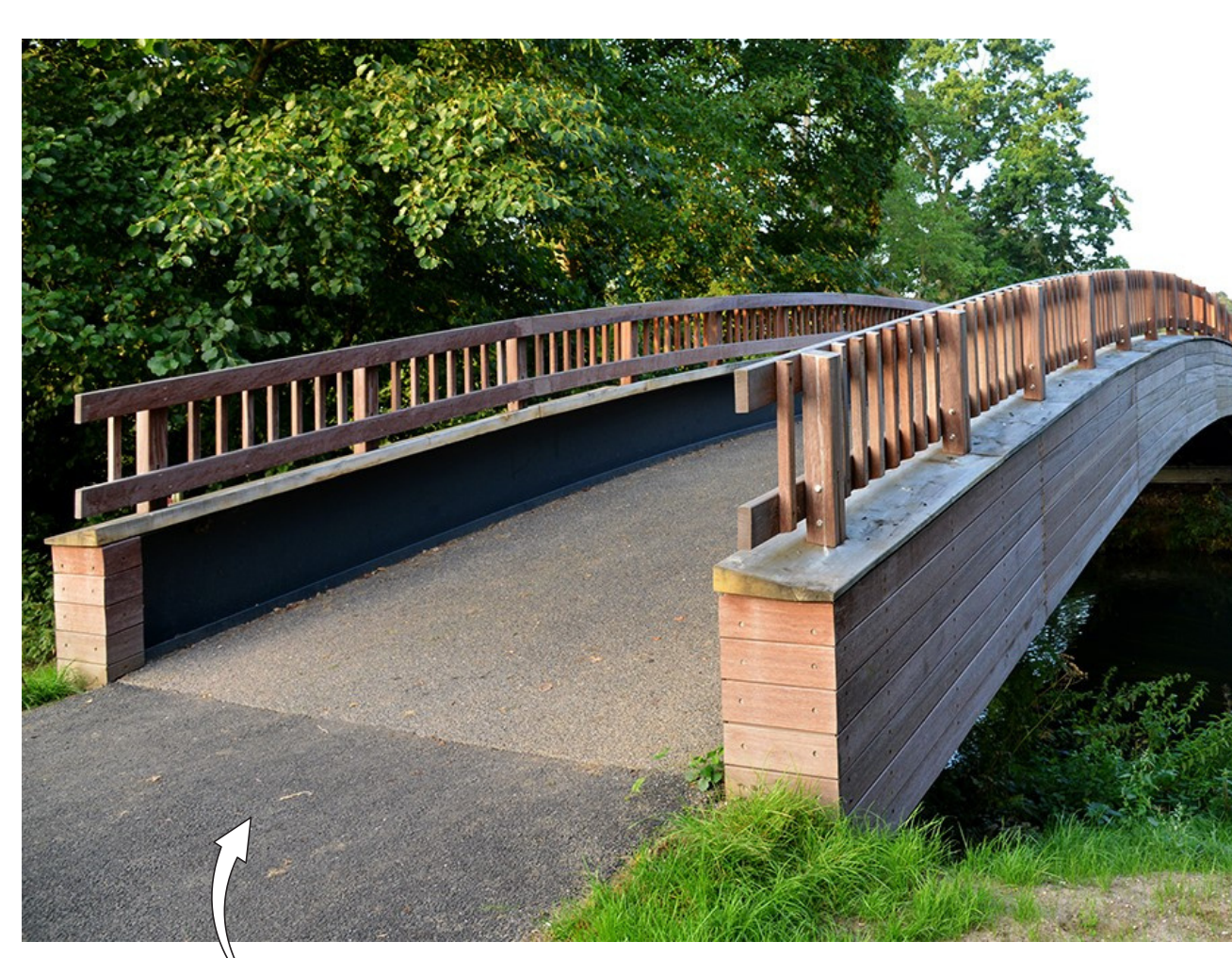
Shallow arch with graded crossing