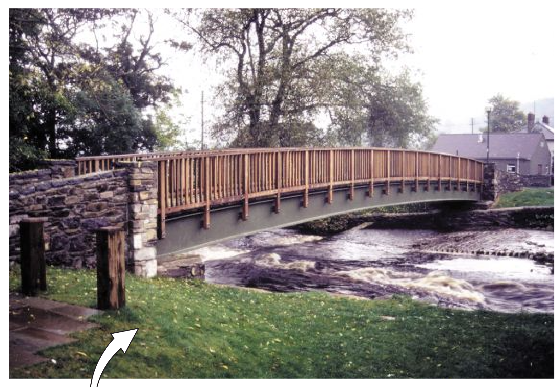
V Different style of parapet