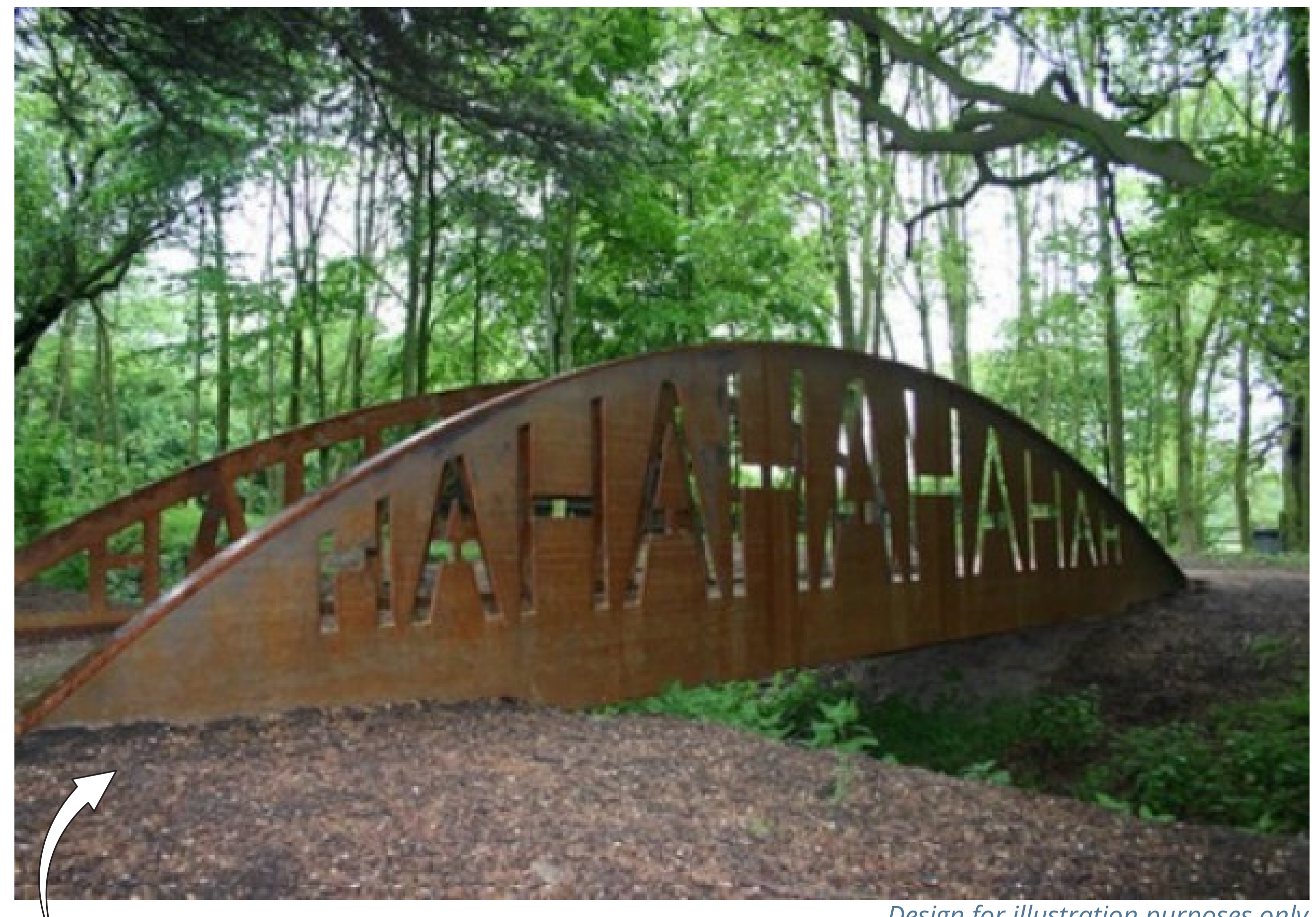
Design for illustration purposes only

Statement structure with customisable design/graphic)